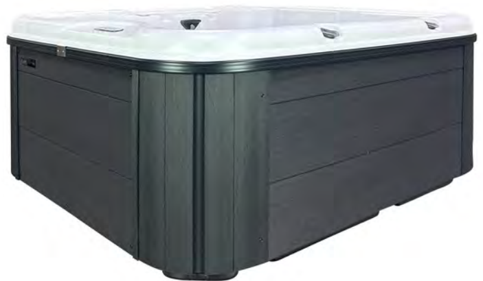
Shell: Drift | Cabinet: Black