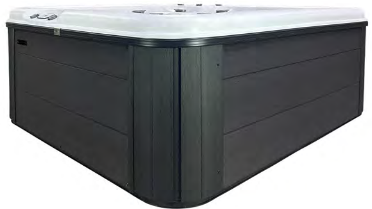
Shell: Drift | Cabinet: Black