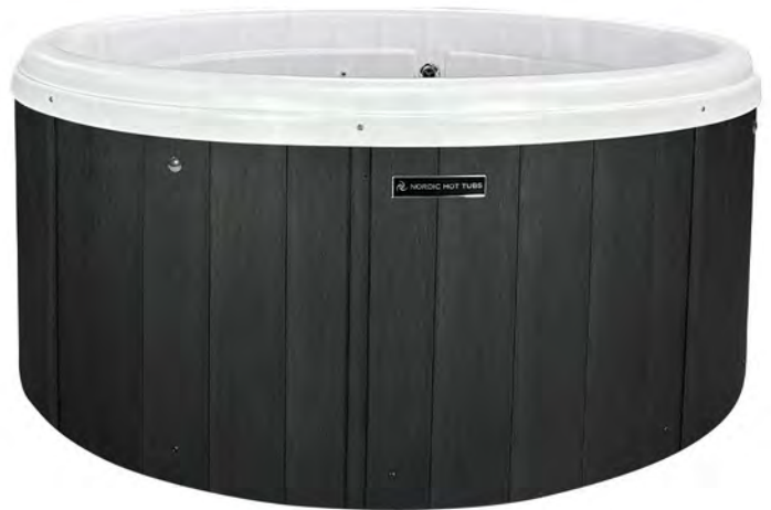
Shell: Drift | Cabinet: Black (Shown with MLP Option)