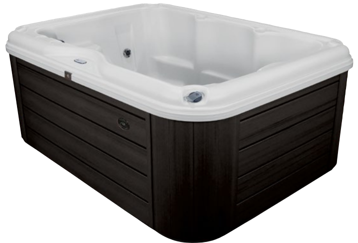
Shell: White | Cabinet: Black