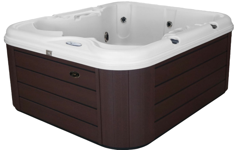
Shell: White | Cabinet: Mahogany