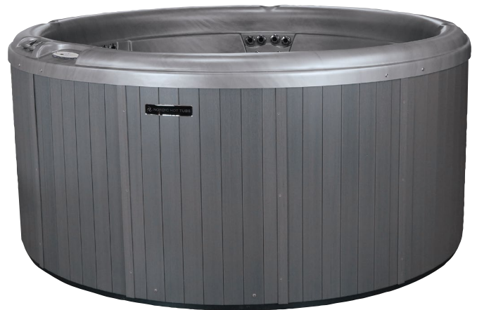
Shell: Eclipse | Cabinet: Charcoal