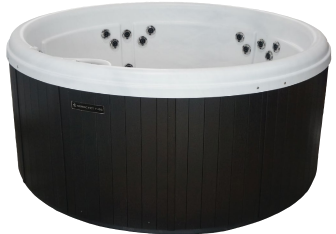
Shell: Drift | Cabinet: Black