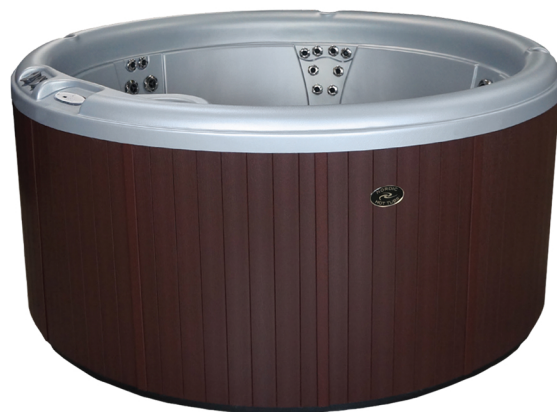
Shell: Silver | Cabinet: Mahogany