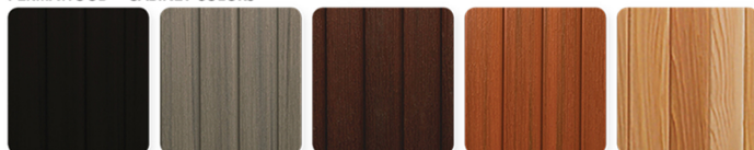
Black Charcoal Mahogany Teakwood Natural Cedar (upgrade)

Color samples are for reference only. Actual product color may vary slightly. Nordic Products Inc. reserves the right to change any specifications without notice.